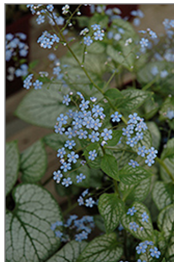
Jack Frost Bugloss flowers

* This is a 'special order' plant - contact store for details