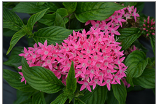
Lucky Star Deep Pink Star Flower flowers