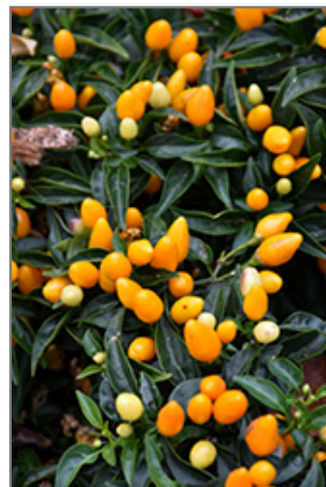
Sedona Sun Ornamental Pepper fruit

Sedona Sun Ornamental Pepper is an herbaceous annual with an upright spreading habit of growth. Its medium texture blends into the garden, but can always be balanced by a couple of finer or coarser plants for an effective composition.