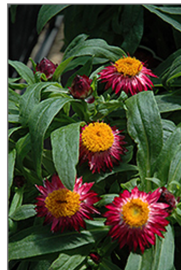
Mohave Dark Red Strawflower flowers