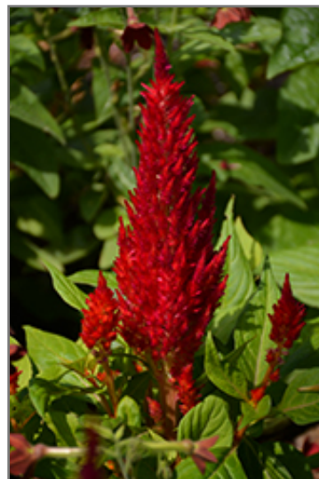
Fresh Look Red Celosia flowers